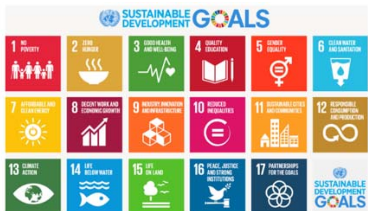
Figure 1: The Sustainable Development Goals (SDGs)

The Sustainable Development Goals (SDGs) represent the globally negotiated and broadly accepted agreement of our Grand Challenges until 2030. The SDGs are formulated into 17 Global Goals (see Figure 1). How does business react to these SDGs? On the upside, there is increasing awareness among business leaders that the SDGs represent a “billion dollar investment opportunity” 1 for businesses as the SDGs provide a strategic outline for innovation and where new markets will emerge as a result of needs that are currently under addressed. On the downside, these opportunities are not obvious and organizations can be tempted to use the SDGs to merely showcase how existing business activities, contribute to the 17 global goals. While such examples are important, they further accentuate the “big disconnect” of business doing a lot of good while at the same time the state of the world is deteriorating. It is critical to enable business to quantum leap from focusing predominantly on its current activities and considering the SDGs as just another reporting requirement instead of the long-term source of innovation and success while serving society and the world.