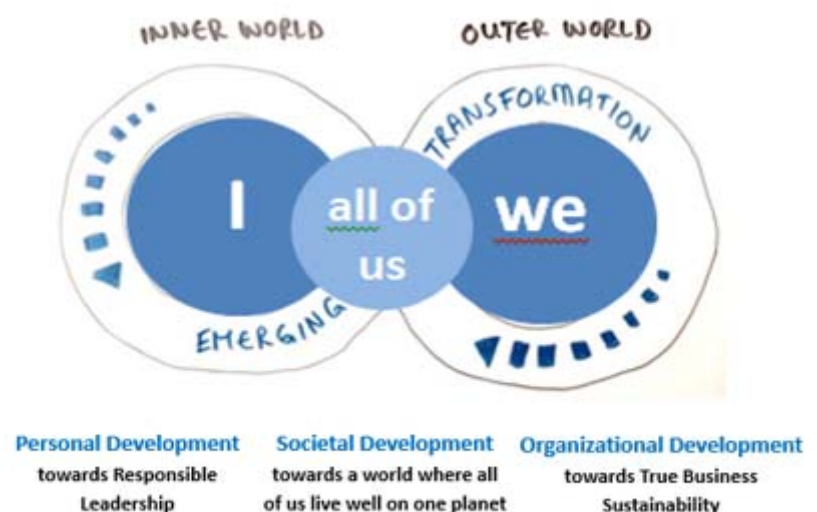
Figure 2: The Circle Model (Muff, 2017)

There is the individual level that addresses the leadership dimension discussed as the third challenge (the “I”), the group level addresses the organizational dimension identified as the second challenge (the “WE”), and the Grand Challenges or issue-related challenges reflects the larger societal dimension of the first challenge (the “ALL-OF-US”). These three dimensions are interconnected and interdependent. Wanting